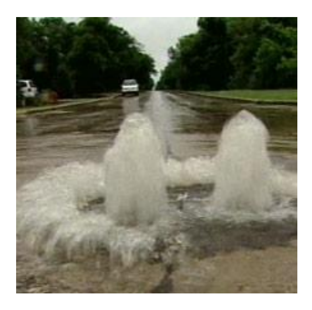
Figure 5B. The manhole is overflowing and flooding because of a system that was over capacity.

Figure 5A. Sanitary sewer backup can result in a sinkhole. These cause the most monetary damage because roads and utilities need to be replaced.