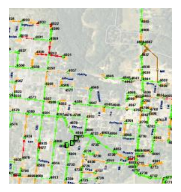
Figure 6. Zoomed in portion of the final GIS. Green pipes and manholes are structurally sound with positive flow. Orange and yellow manholes are not in immediate need attention, but should be considered in the long run of replacements. The red pipes have a negative slope and need immediate attention. The red manholes are structurally poor and require replacement.

As a result of the analysis, a six-phase plan has been completed to cover all repairs deemed necessary from this study. This six phase plan addressed the issues in a timeline that was relevant to the overall condition of the sanitary sewer. Those in need immediate repair were included in the first phase of the plan, while those repairs that were considered a low priority were pushed back until later phases (Figure 7).