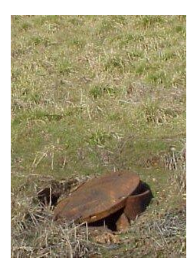
Figure 2A. Existing manhole with a broken lid and insufficient casting.

Figure 1. A manhole in very poor condition with a very high infiltration rate with cracks in the walls. This manhole would have been given a rank of "one" for condition due to the size of the cracks and a "five" for infiltration rate based on the amount of water potentially entering the structure. This structure would have been scheduled for replacement as soon as possible.