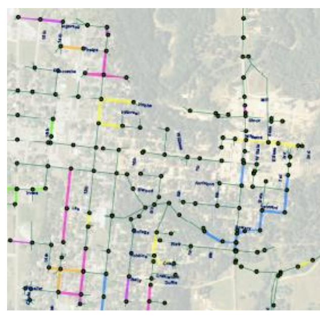
Figure 7. Zoomed in portion of the six-phase recommendation plan to televise and replace pipes. The yellow colored pipes signify the first year televising and replacement plan. The orange and pink colored pipes indicate phases 2 and 3, respectively. Phase 4 is depicted by the purple pipes, while the light blue and dark blue pipes represent phase 5 and 6.

be, but they are not an immediate threat to the system.