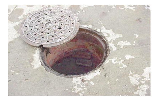
Figure 2B. Existing manhole with crumbling brick.

The defects were then analyzed to determine which were the most severe.