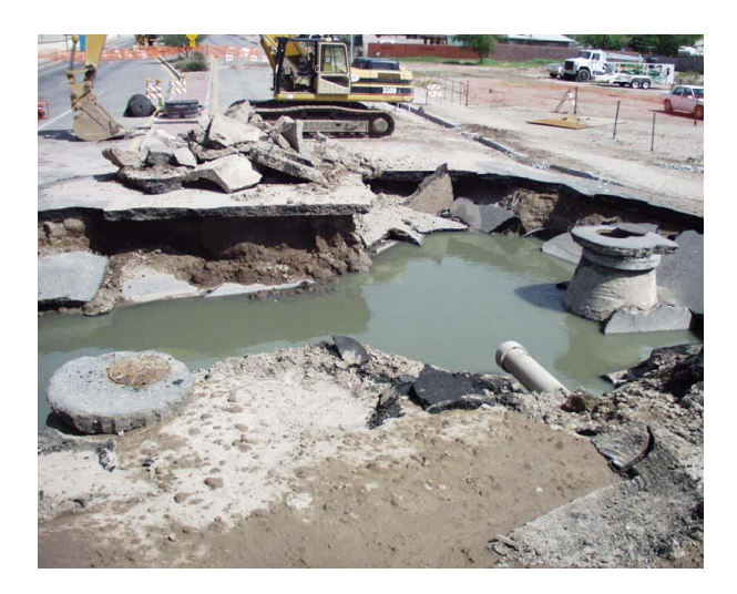
Figure 5A. Sanitary sewer backup can result in a sinkhole. These cause the most monetary damage because roads and utilities need to be replaced.

individual flow lines were analyzed in the attribute to determine which lines were not flowing properly. The analysis also analyzed the onsite data collected to determine which structures were in need of replacement or immediate attention. It was determined that there were forty structures in need of immediate replacement (Figure 6).