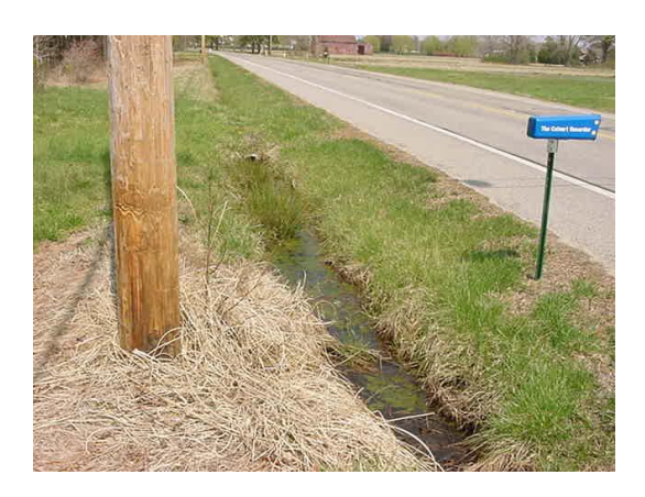
Figure 3. Here ditches are used for drainage along roadways.

the data was then exported to an ArcPad project for field editing. The geodatabase was literally "checked out" from the server like a library book and used in fieldwork. When the data was checked back into the server, the geodatabase was updated with the new information.